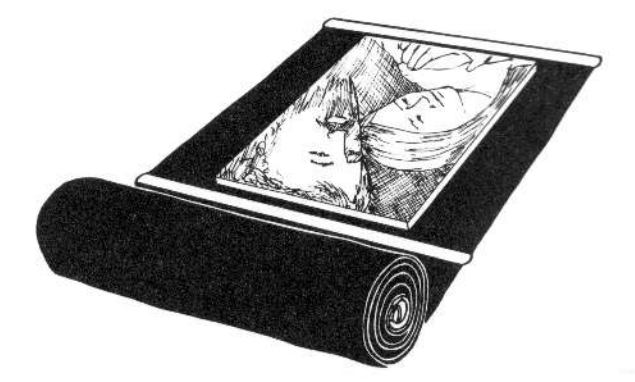
THE FIRST PLAQUE ON THE UNDERLAY (STORYTELLER'S PERSPECTIVE)

Begin to go around the circle, asking each child if he or she would like to bring something to put by the plaque. Some children may not be able to think of anything, so move on if it looks as if they are stuck. You can come back to them later. If they are still stuck, that is okay. Many children learn by watching as well as by doing.